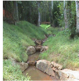
Rework of banks and step pools installed, to slow the storm water flow