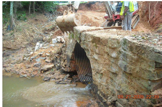
Harmony Grove Road lane collapsed, galvanized storm water pipe crushed and buckled