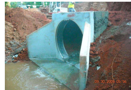
New concrete storm water pipe and head wall installed and functioning