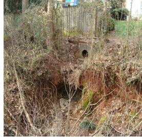
Head wall and bank erosion