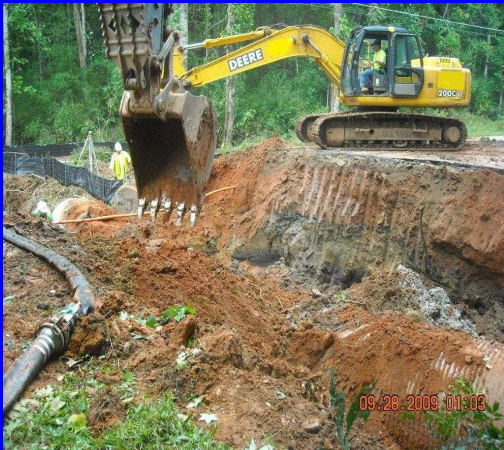
EMERGENCY Brownlee Road collapse. Work started to replace damaged piping and road repairs, with Box Culverts. **See front cover.

Visit our Website at www.dickersongroup.net