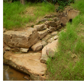
New headwall and hand built rock structures