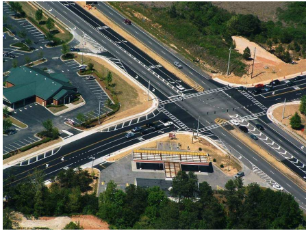
SR20 @ Old Peachtree Road, Intersection Improvements Project