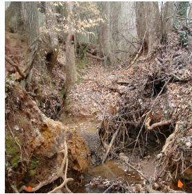
Erosion of banks, exposed tree roots and stagnant water