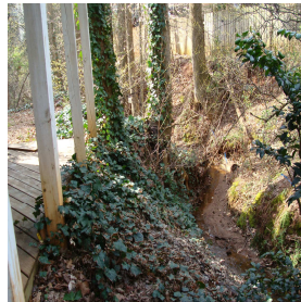
View from homeowners back porch